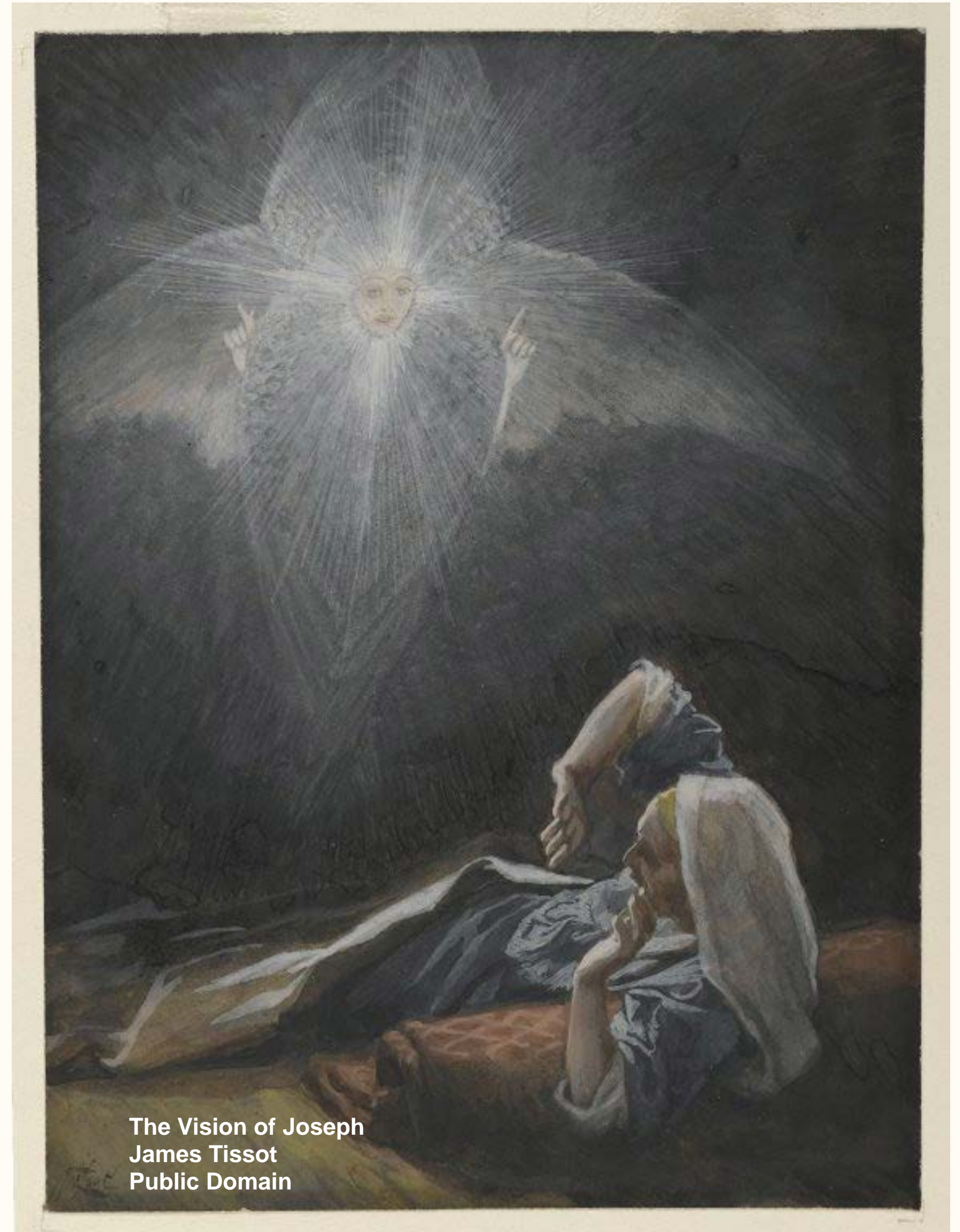
The Vision of Joseph James Tissot

A message of comfort that the pregnancy of Mary was a miracle of God in fulfillment of prophecy.