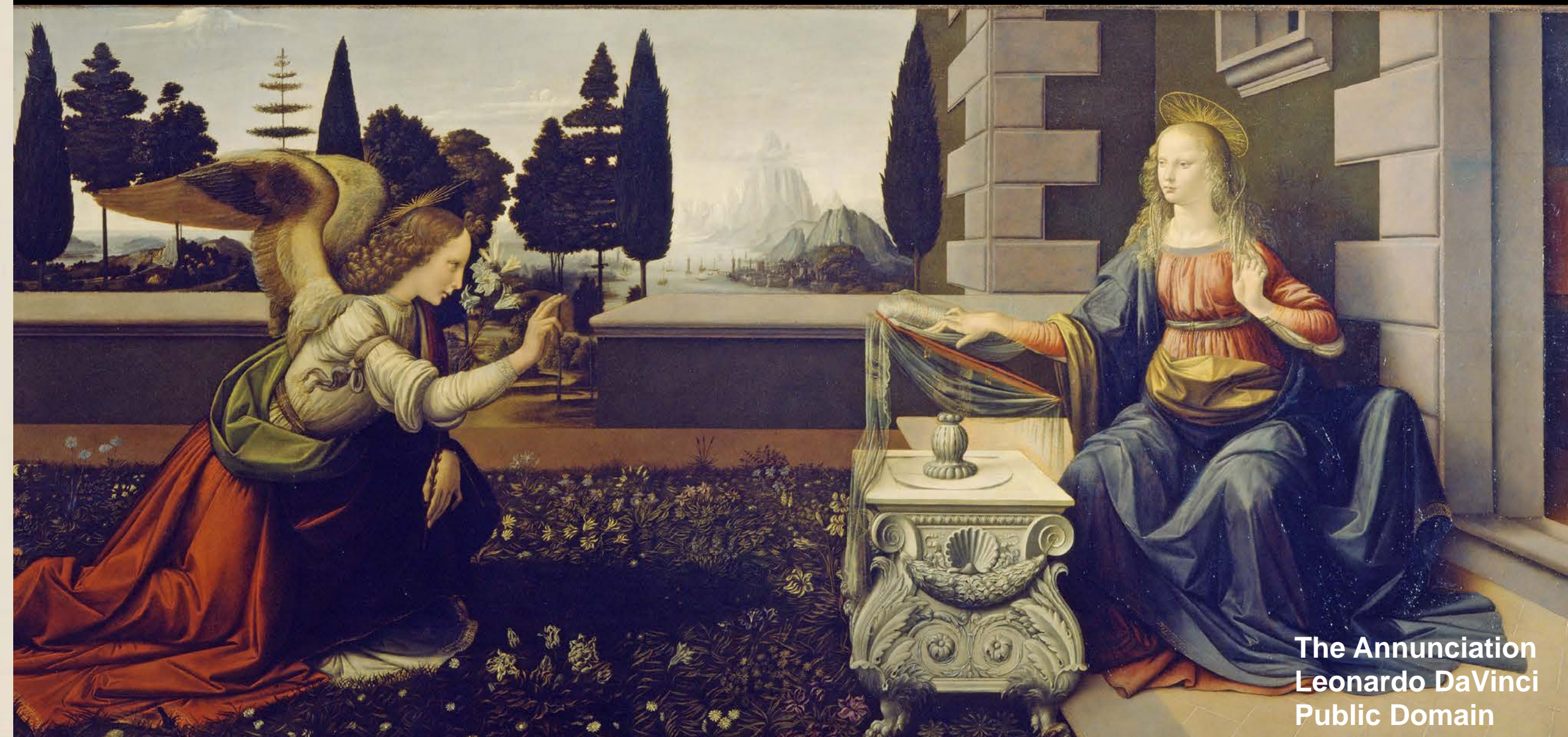
The Annunciation Leonardo DaVinci Public Domain