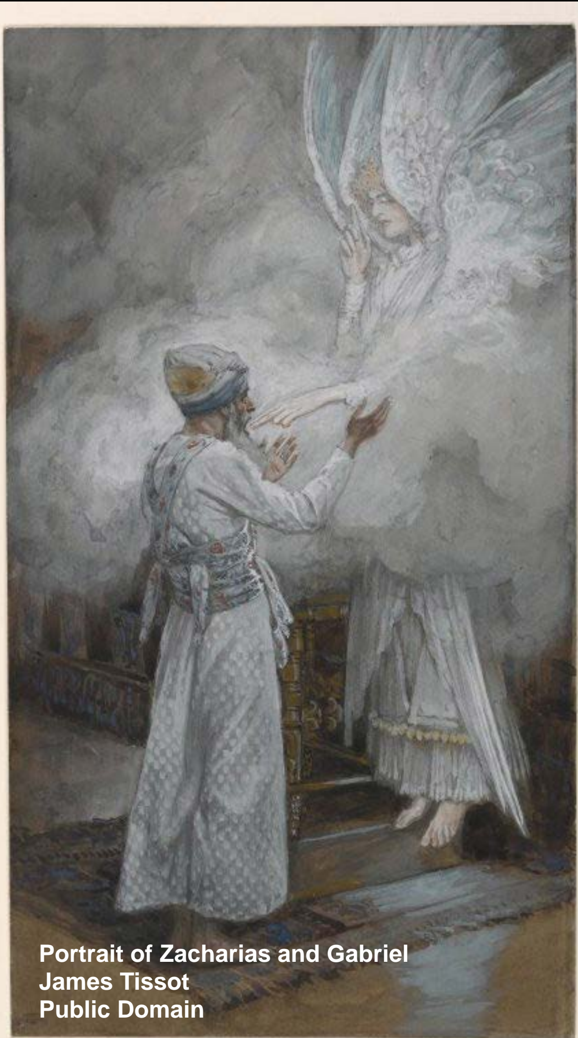
Portrait of Zacharias and Gabriel James Tissot Public Domain

To Zechariah, Luke 1:5–25; To Mary, Luke 1:26–36; To Joseph, Matthew 1:18–21