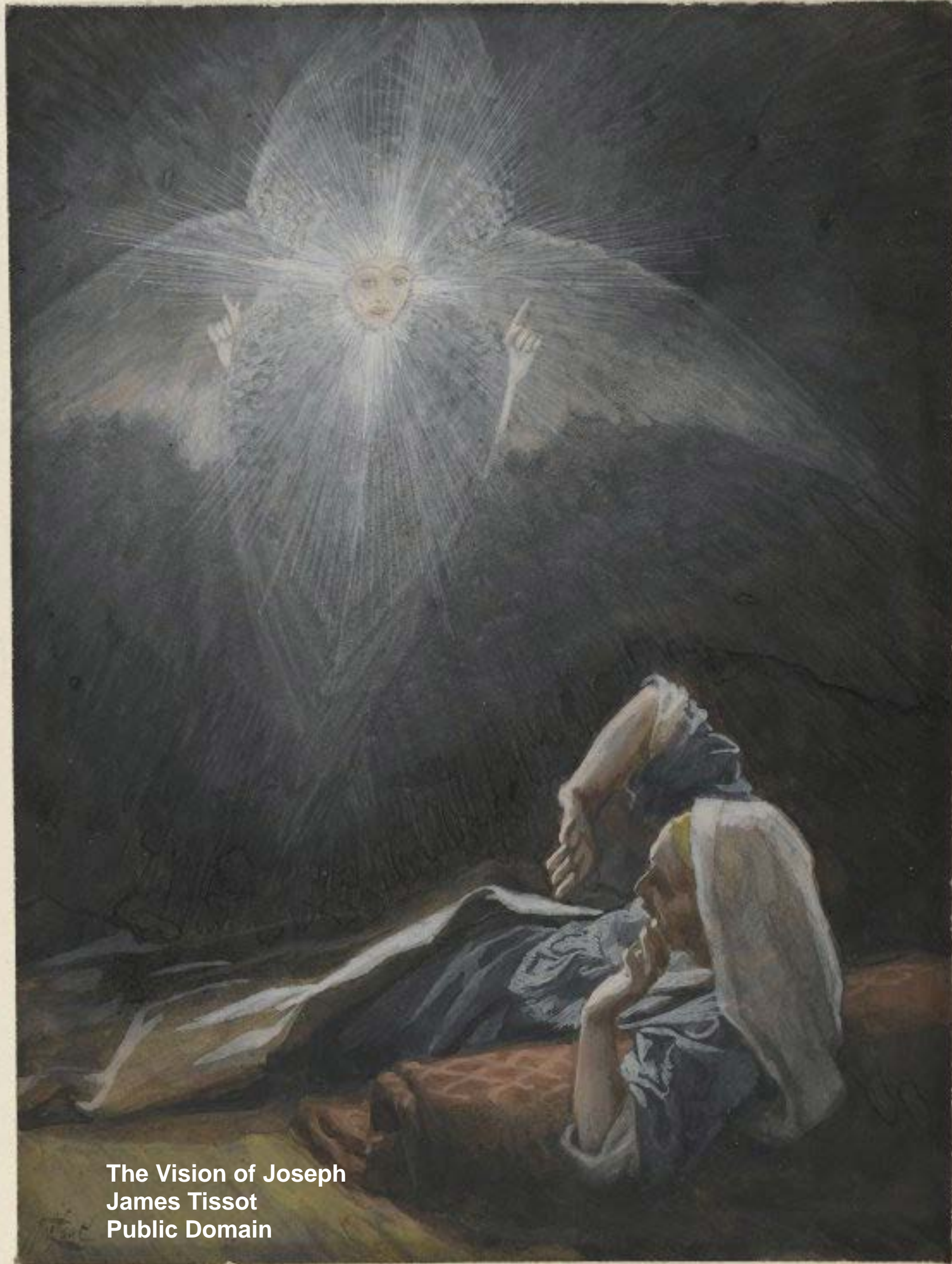
The Vision of Joseph James Tissot

Matt. 1:20 , “But while he thought about these things, behold, an angel of the Lord appeared to him in a dream, saying, ‘Joseph, son of David, do not be afraid to take to you Mary your wife, for that which is conceived in her is of the Holy Spirit.’ ”