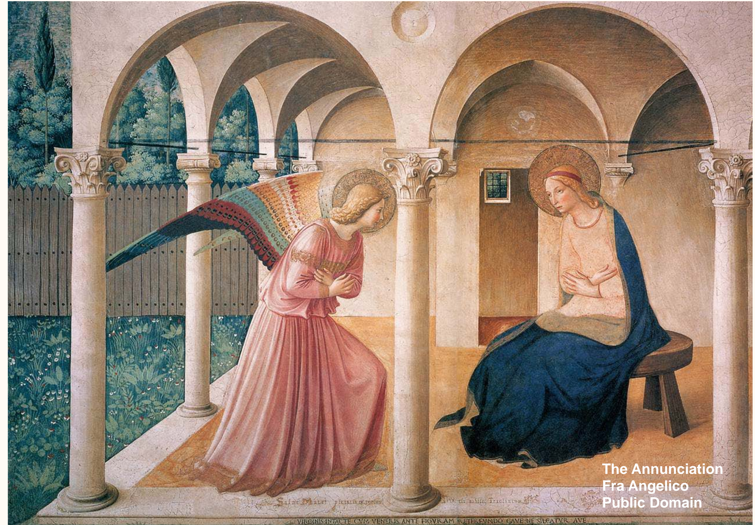
The Annunciation Fra Angelico

Luke 1:29 , “But when she saw him, she was troubled at his saying, and considered what manner of greeting this was. Luke 1:30 , “Then the angel said to her, ‘Do not be afraid, Mary, for you have found favor with God. Luke 1:31 , “ ‘And behold, you will conceive in your womb and bring forth a Son, and shall call His name Jesus. Luke 1:32 , “ ‘He will be great, and will be called the Son of the Highest; and the Lord God will give Him the throne of His father David. Luke 1:33 , “ ‘And He will reign over the house of Jacob forever, and of His kingdom there will be no end.’ ” [NKJV]