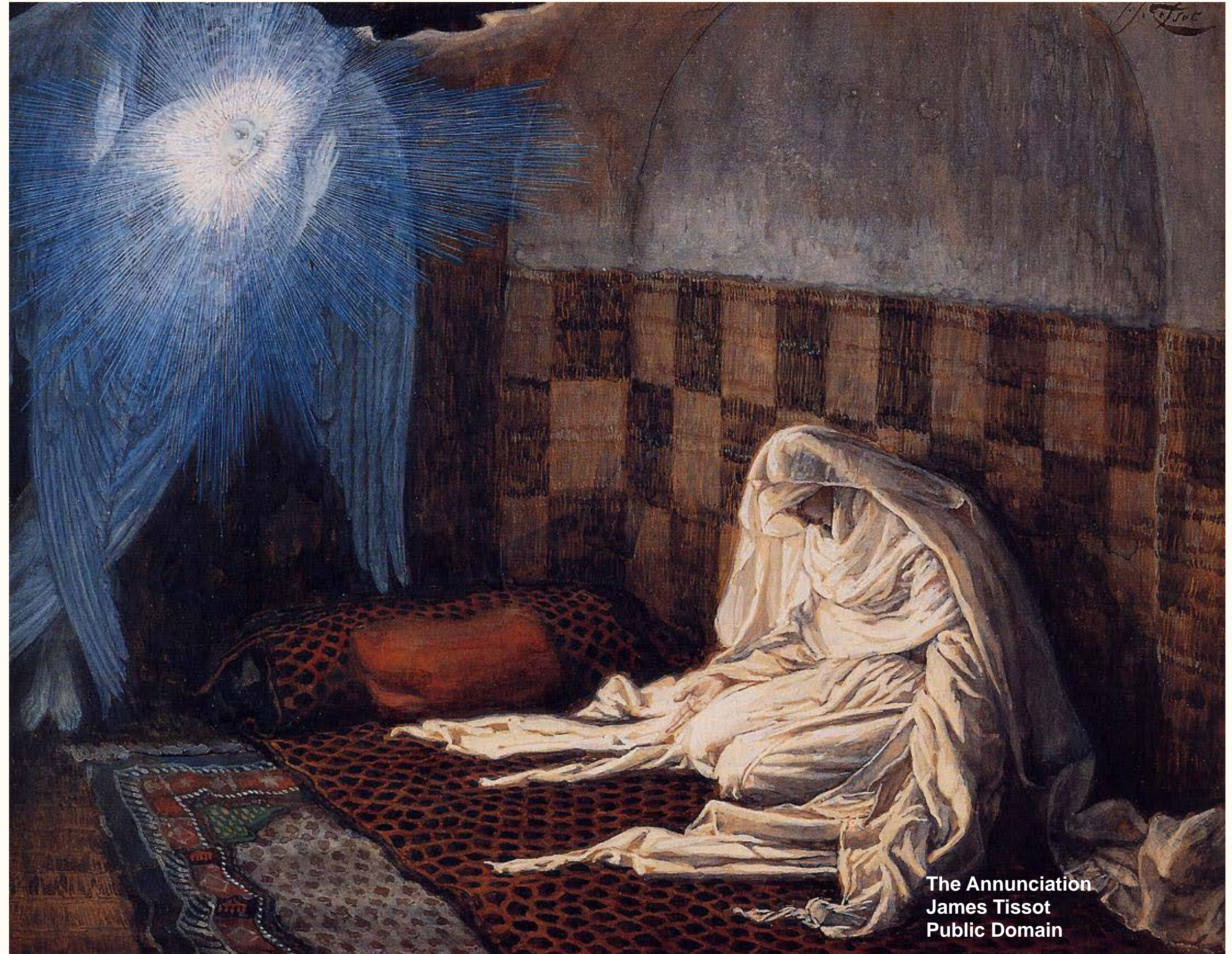
The Annunciation James Tissot Public Domain