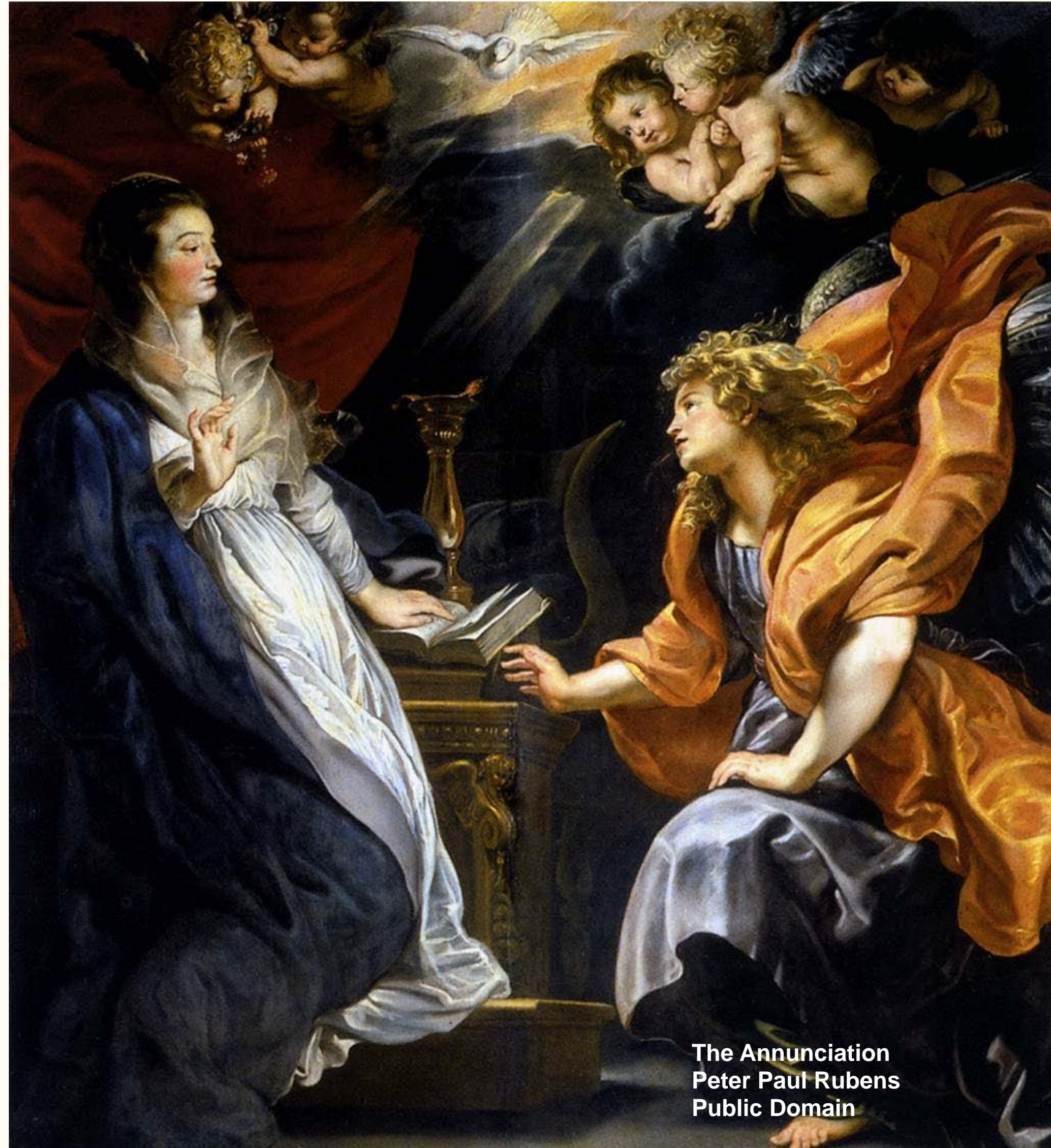
The Annunciation Peter Paul Rubens

Luke 1:26 , “Now in the sixth month the angel Gabriel was sent by God to a city of Galilee named Nazareth,