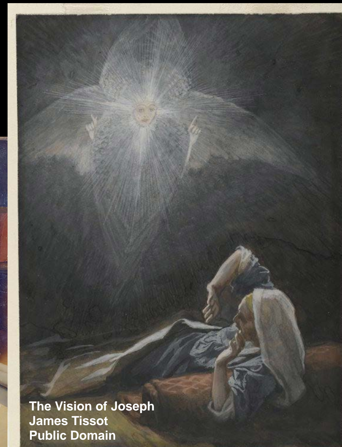
The Vision of Joseph James Tissot Public Domain