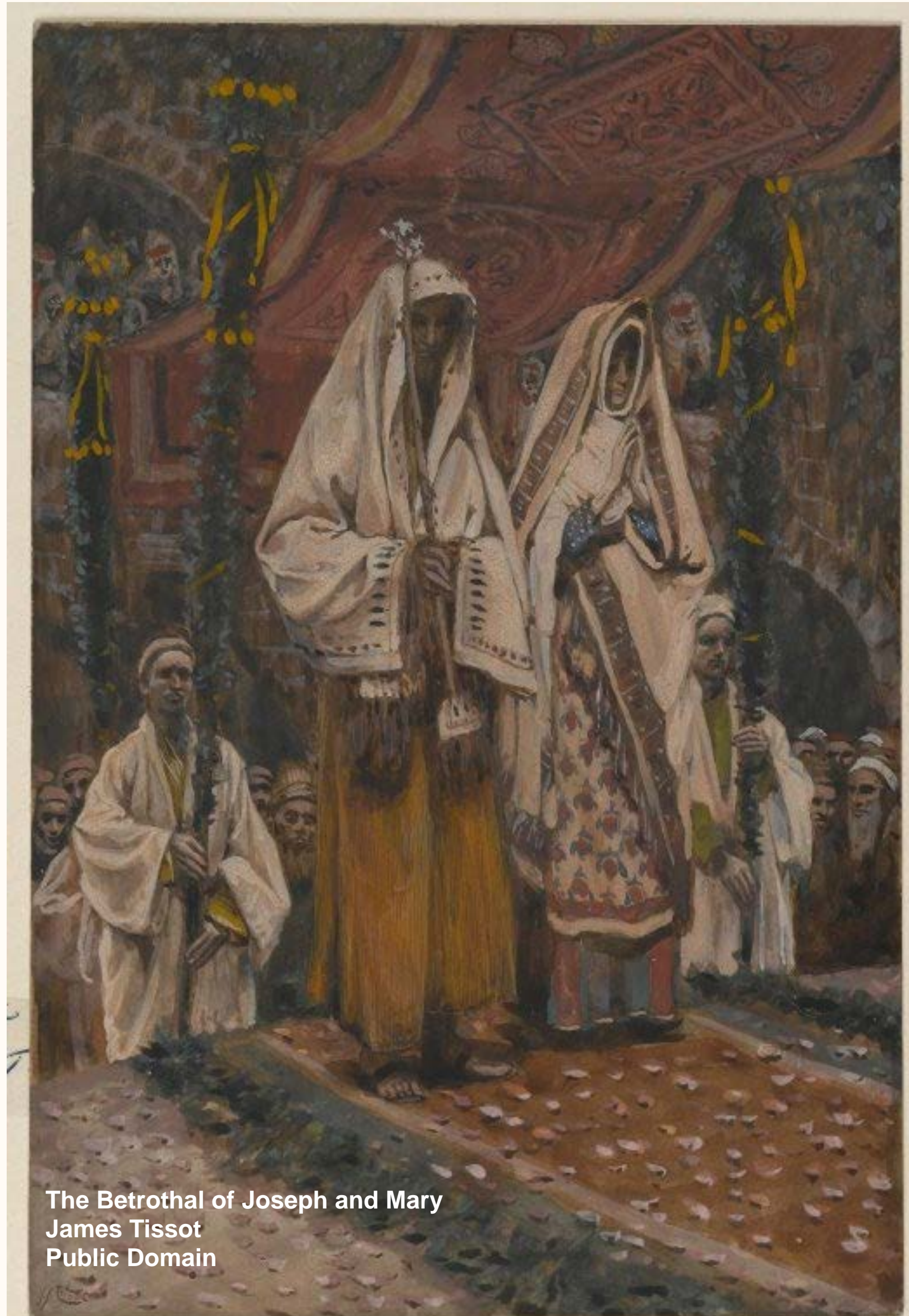
The Betrothal of Joseph and Mary James Tissot

Matt. 1:18 , “Now the birth of Jesus Christ was as follows: After His mother Mary was betrothed to Joseph , before they came together, she was found with child of the Holy Spirit.”