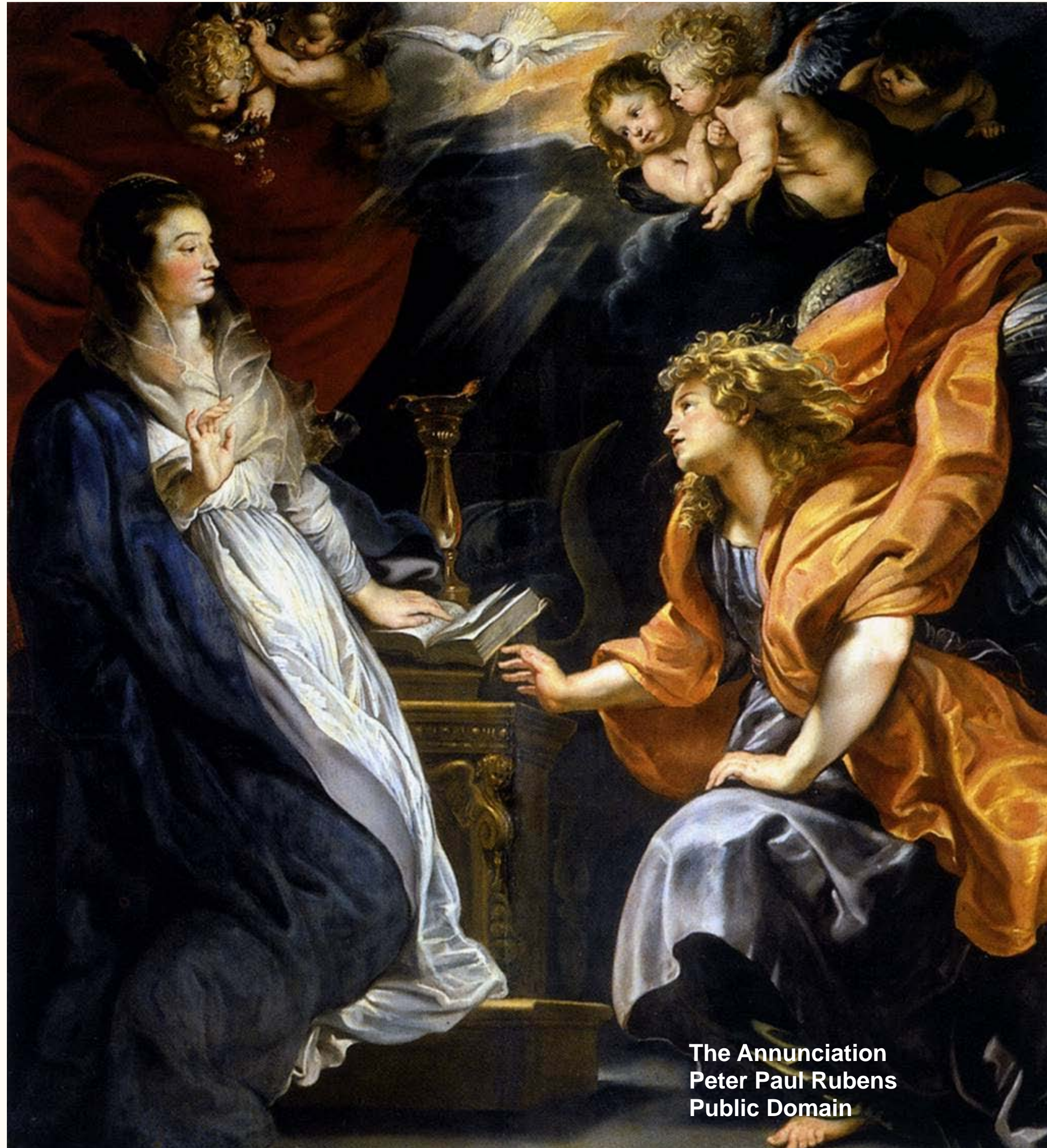
The Annunciation Peter Paul Rubens Public Domain