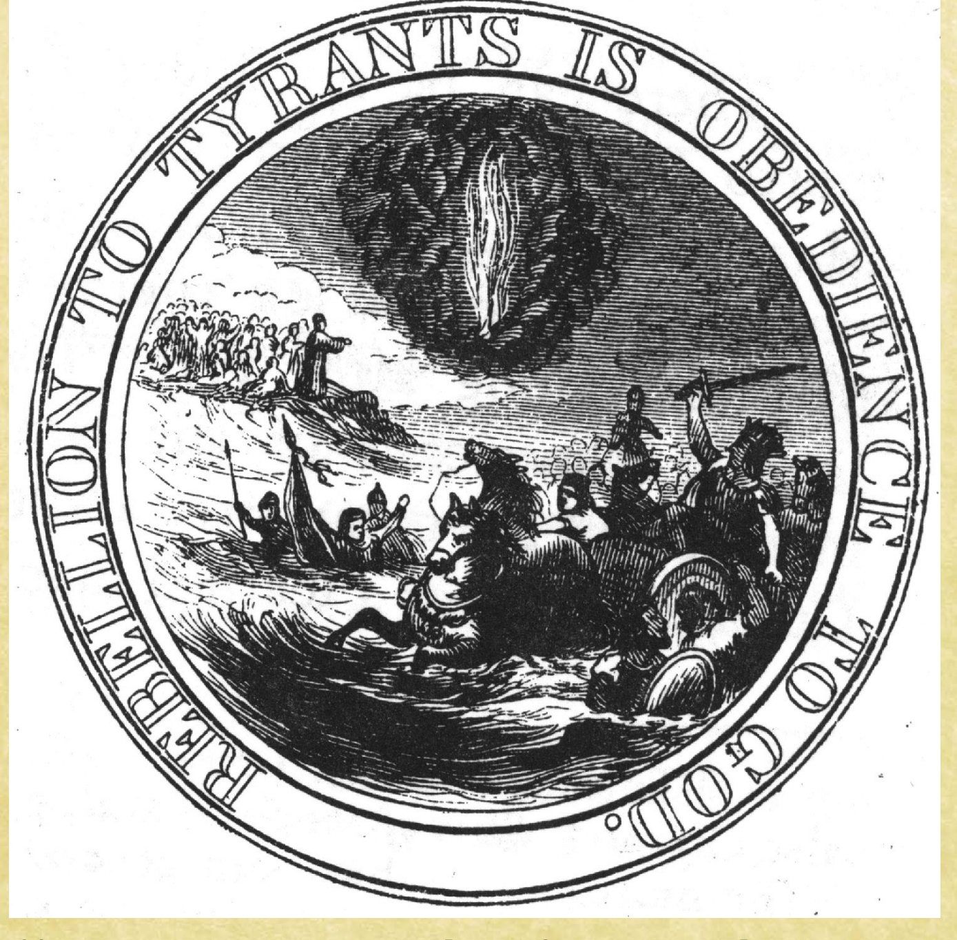
Jefferson's suggestion for a national seal