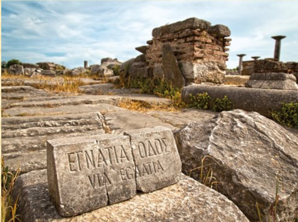
Ancient sign for the Egnatian Way in Philippi