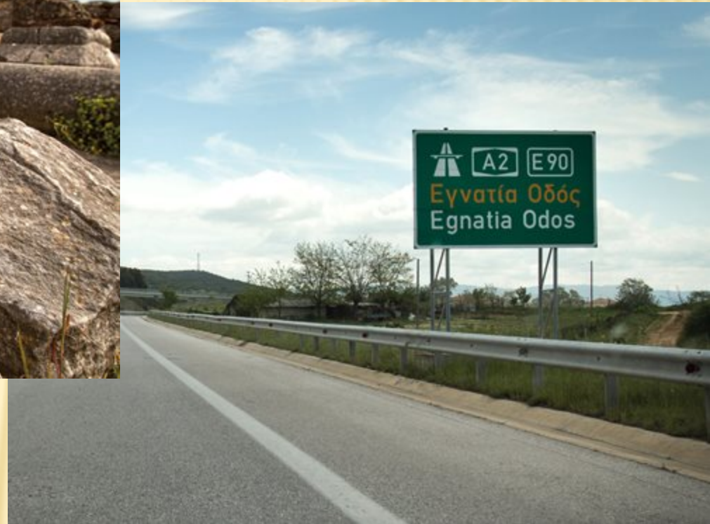
Modern Sign for the Egnatian Way