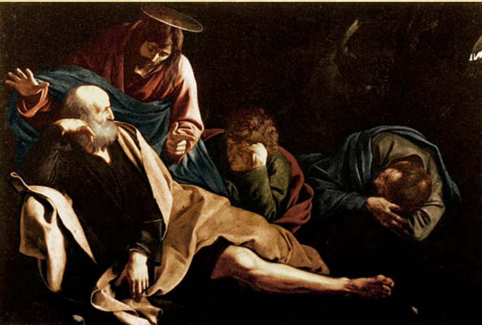
Carravaggio, Jesus on the Mount of Olives