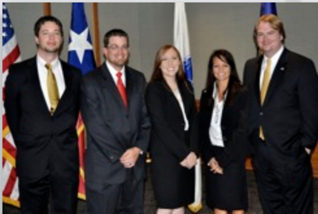
Research Fellows (2 nd and 3 rd Year Law Students)