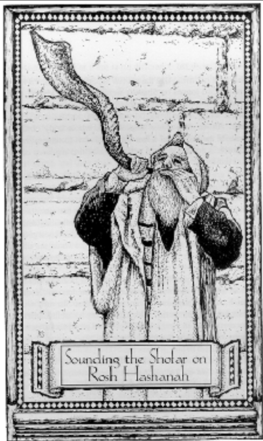
Sounding the Shofar on Rosh Hashanah