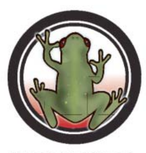
Amphibians (Frogs) Exodus 7:26-8:11