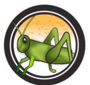
Locusts Exodus 10:1-20