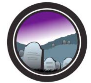
Death of Firstborn Exodus 11:1-12:36