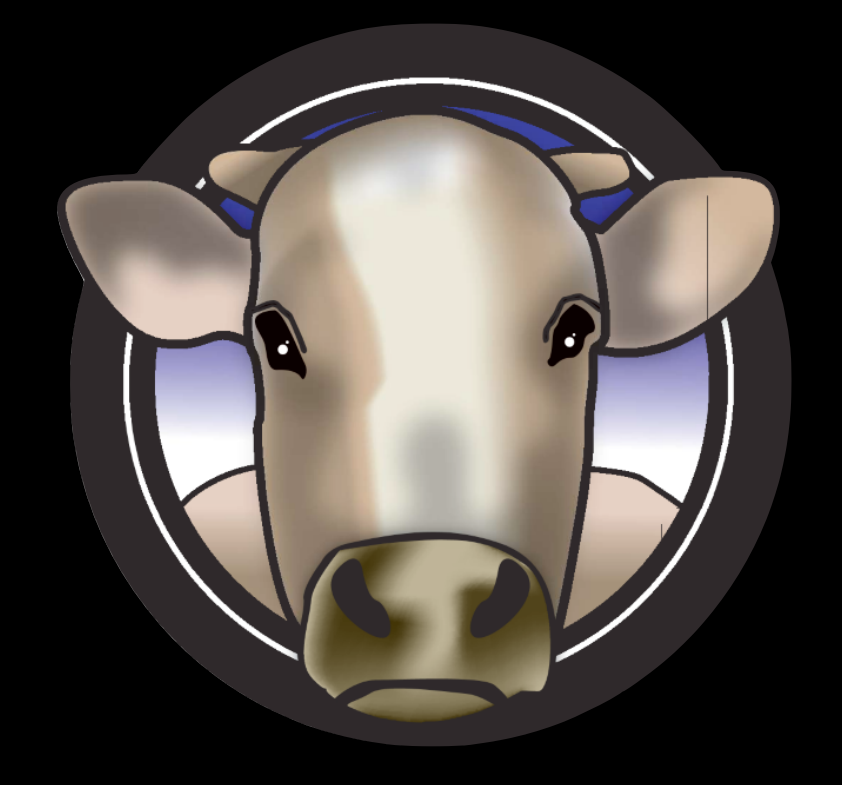
Ex. 9:2, "'For if you refuse to let them go, and still hold them,

Ex. 9:3, "behold, the hand of the LORD will be on your cattle in the field, on the horses, on the donkeys, on the camels, on the oxen, and on the sheep—a very severe pestilence."