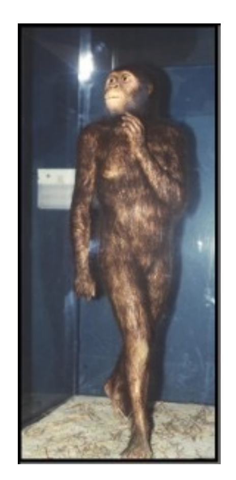
Mannequin of "Lucy", Living World Exhibit, St Louis Zoo